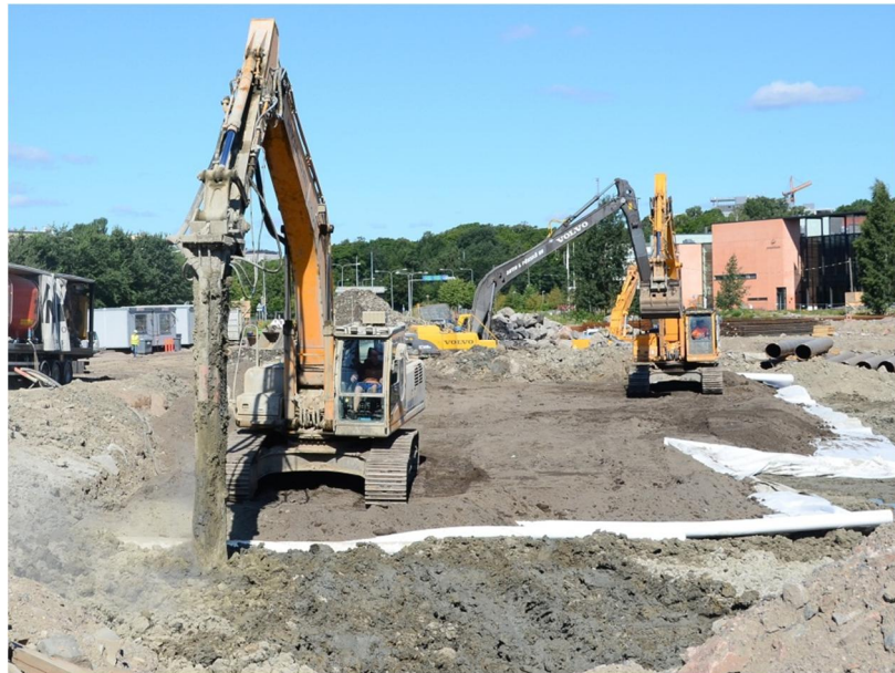
Figure 2. The stabilisation on Arcada 2

from the site were similar and caused no further actions. The stabilisation of the abandoned soil is depicted in Figure 2.