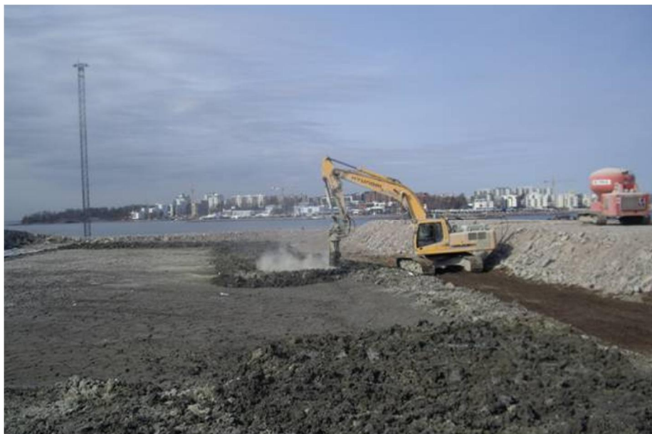
Figure 3. Stabilisation work on Jätkäsaari.

The challenge of the pilot was to stabilise all of the sediments deposited in the basins. In order to mass stabilise the total amount, the access of an excavator the size of 30 tonnes on the basins was necessary. This meant that the stabilisation needed to be stable enough to carry the weight of the excavator. The stabilisation on Jätkäsaari is depicted in Figure 3.