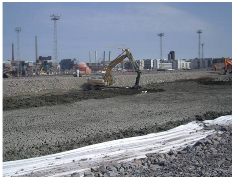
Figure 4. Stabilisation work on basin 2 (in front right corner of the picture one can see the loading embankment and geotextile and on the back of the picture is the stabilisation machine running, leaving the un-stabilised mass in the middle).

The stabilisation work began 13.4.2011 from basin number 1 according to the principle presented in Figure 4. The sides of the basin were stabilised first on 5 m x 5 m area using the supportive banks of the basin. After the stabilisation a geotextile and loading embankment was spread on top of the stabilised layer to create a platform for the excavator. The stabilisation work succeeded from the outer limits of the basin towards the middle of the basin.